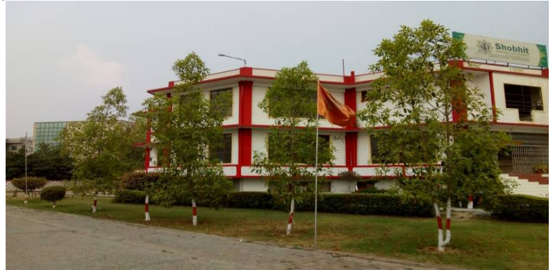
Fig. 1: E. ganitrus Roxb. at SIET (Deemed to be University), Meerut (UP), India

Explants (nodal part) used in this study were collected from the trees (6-7years old approx.) from the compounds of Shobhit Institute of Engineering and Technology, Meerut, Uttar Pradesh, India (Fig.1). The collected samples were brought to the laboratory for further experimentation. The explants ( 3\pm0.3 cm in length) were treated with ( 1.5\% \ w/v ) bavistin for 30min. Surface sterilization of the explants was performed under the laminar air flow by treating with 70% ethanol for 30 seconds and HgCl<sub>2</sub> ( 0.1\% \ w/v ) (HiMedia, India) for 4 min. The explants were thoroughly rinsed with autoclaved double distilled water for 4 min. (5 times) within the laminar air flow.