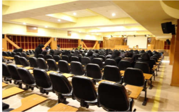
Figure 4: Example of conference room space

This section is for discussion between students and professors and experts are taken into account. When designing this space should be seen in the higher classes. Unrelated to the problem of commuting (commuting students to classes, etc.) does not interfere. Space is desirable in about 24 to 30 people. Conference rooms can be natural or artificial light supply (Fig. 4)