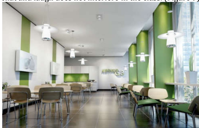
Figure 9: An example of cafeteria space

Space is your time students can spend their leisure hours. This space should be comfortable, intimate, fantasy and good Buddha is out and green space. This space should be a place where student's relative freedom there is for fun, chat and laugh does not interfere in the class. (Figure 9)