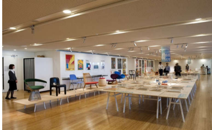
Figure 6: Example of lounge space