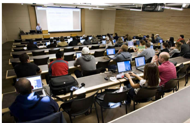
Figure 3: Example of room photos and slides

This space does not have natural light. In addition, if the spots where investments were considered Natural light we must also be considered thick curtains. Latex wall paint should be considered to reduce the shiny walls are not in class. (Figure 3)