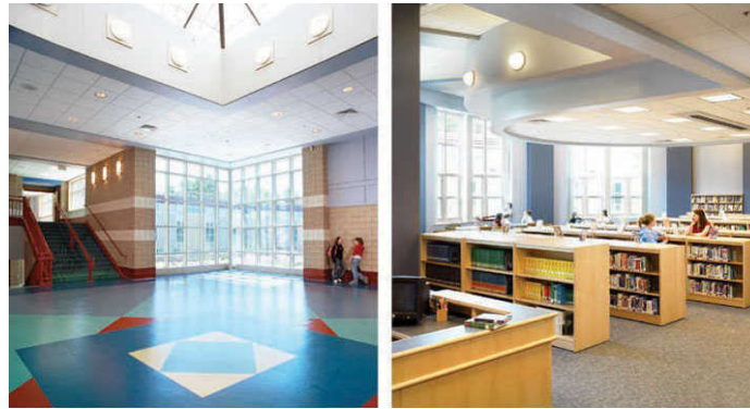
Figure 8: An example of space