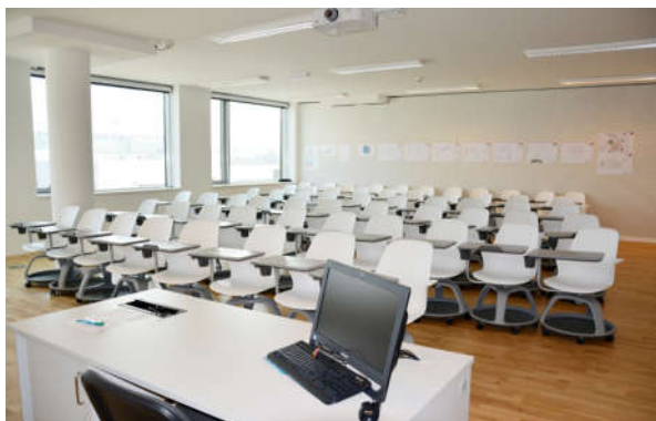
Figure 2: Example of classroom space

Plaster wall behind students should also be made well. To the voice of the teacher in front of class to resist. The color should be noted that the color of the floor mat classes must be considered Paint walls must be smooth color such as light blue, cream or pale green. Also in projects in the field of educational facilities receivables that are stained in staining the cabinets should operate smoothly. But space in front of the eyes of people of color staining rest is distinct parts. If appropriate use of color and light to suit the needs of users can be instilled in them a sense of calm and security. Below are the constituent elements of color and their effects on the psychological impact of colors on the use of space and educational facilities has been paid. (Table 1).