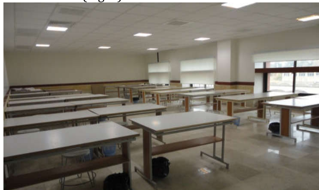
Figure 5: Example of technical drawing studio space

If we use the natural light, The Light north. Uniformly spreads the sound to suit the acoustics of the space is in all rooms which makes it easier to use contacts from the speaker's speech. Studio technical drawing: The area of this space based on the table drawing and standards as it is determined. It is usually considered to be space for 24 to 30 people. The studio can be natural or artificial light, but the essential point about light design, lack of shade. That is why it is better to use artificial light and evenly. Light used must be provided by fluorescent lamps and bulbs should be installed in the ceiling above the drawing tables to create a minimum of shadow (Fig. 5)