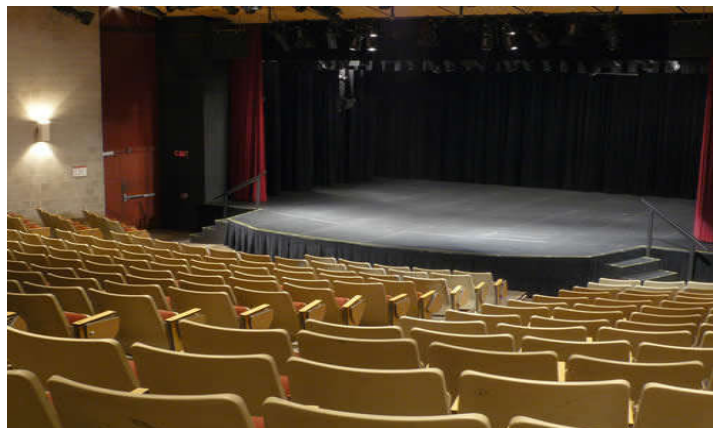
Figure 7: Example of the amphitheater

Amphitheater in order to make room for gatherings, presentations, artistic performances and is designed. In addition to the standards and criteria should be standardized amphitheater venues such as emergency exits and which are related to theaters ,Hall also has Bashnd.nvr provided by artificial lighting And materials should be selected in such a way that the sound insulation. Hall has space to the side of the stage, the room behind the scenes and more. (Figure 7).