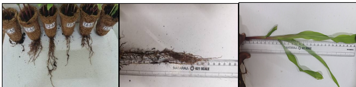
Fig.4 The images of Rooting ability and Shoot length of the treated crop plants.

The treatment over the monocot crop Zea mays was carried out to assess the growth and development of plant. The herbal biocomposite coated coir pots enhance the Root length, Shoot length, Entire plant length, Fresh seedling weight and Dry seedling weight considerably. The entire length and fresh seedling weight of with 2.624gm and dry seedling weight of about 0.610gm all the parameters was comparatively and considerably graded when compared with control condition followed by T 4 treatment also has considerable increase in the morphological parameters. The embryonic roots were considerably increased in number about 7 roots has been recorded in T 1 and T 4 also exhibited the high number of roots in 70 roots has been recorded in T 1 formulation and T 2 has been recorded with 52 lateral roots. There is no considerable change has been recorded even the 5,10,15 days of interval Table:5