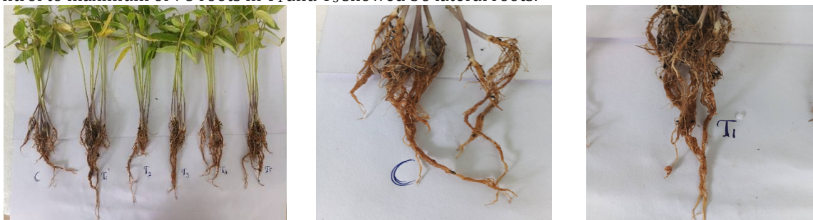
Fig.2 The images of well grown root system after treatment

data. The present data also confirms the No. of lateral roots was considerably increased from 46 in control to maximum of 78 roots in T 1 and T 3 showed 56 lateral roots.