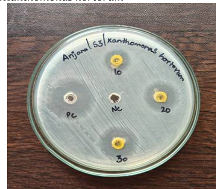
Fig: 7The antibacterial assay using agar well diffusing method for selected herbal bio consortia T 4 against Pseudomonas aeruginosa and Xanthomonas hortorum