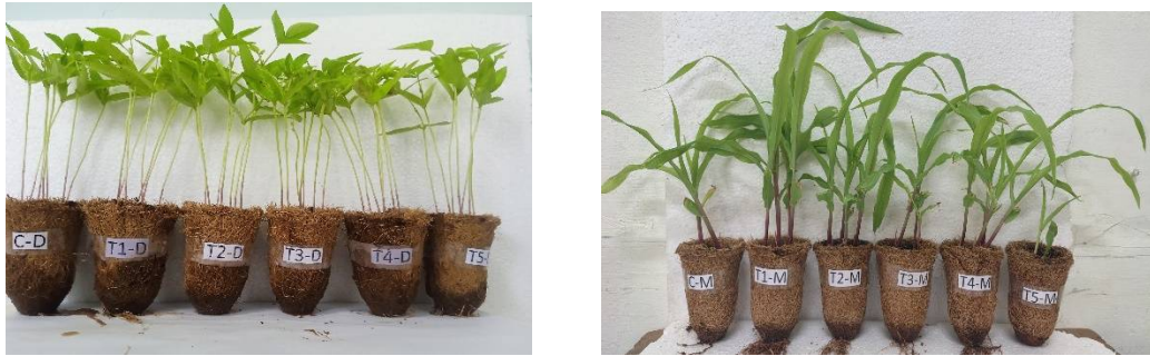
Fig:1 The studied crop plants grown on coated coir pots V.radiata and Z.mays