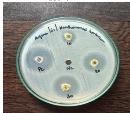
Fig : 5 The antibacterial assay using agar well diffusing method for selected herbal bio consortia T 1 against Pseudomonas aeruginosa and Xanthomonas hortorum