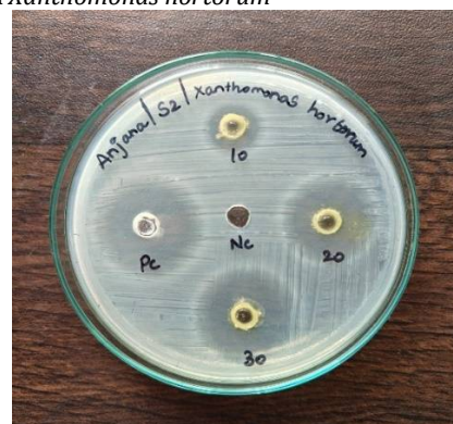
Fig :6 The antibacterial assay using agar well diffusing method for selected herbal bio consortia T 3 against Pseudomonas aeruginosa and Xanthomonas hortorum