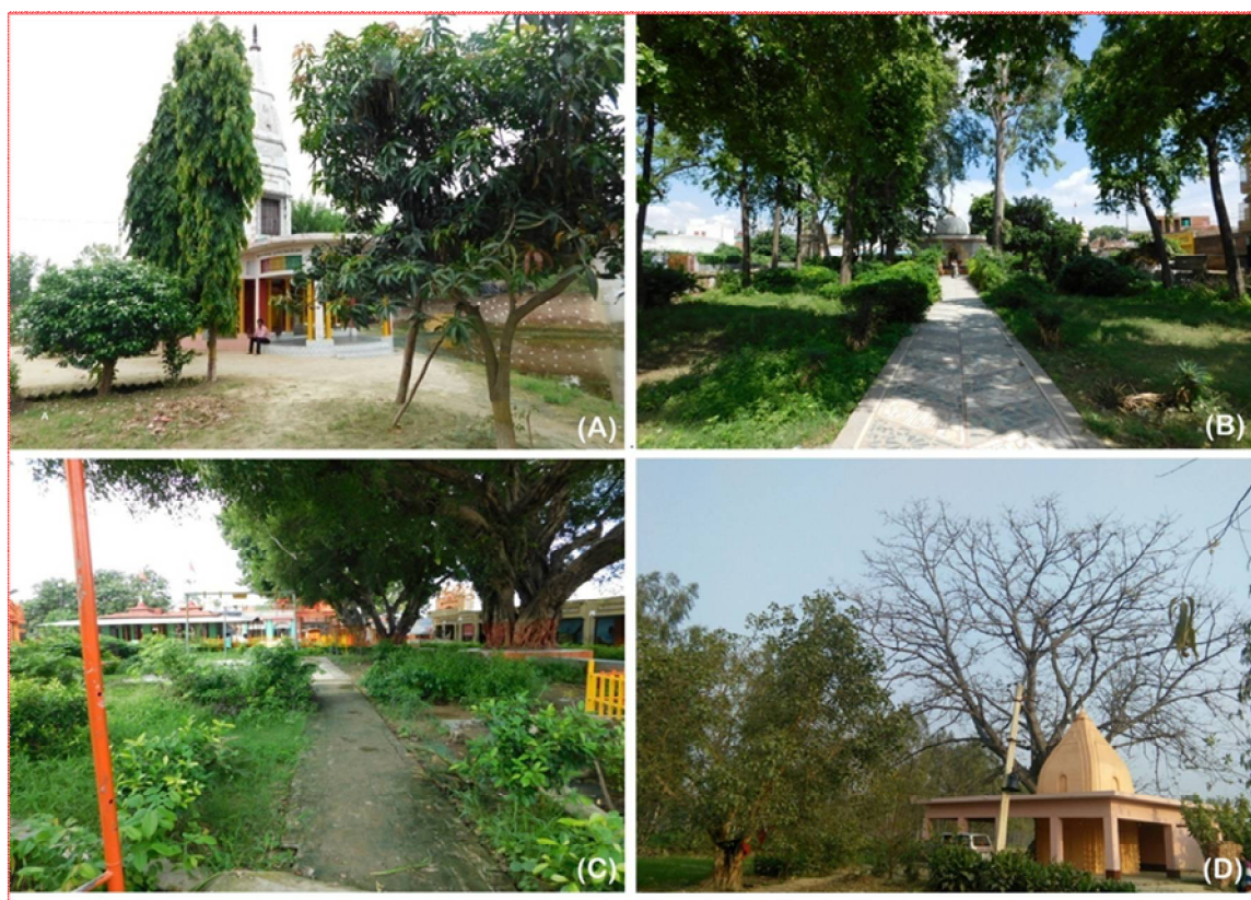
Plate 1. The Sacred groves: (A) Shiv Mandir, (B) Much wale Hanuman ji, (C) Sidhi Dattri Nav Durga, (D) Shid Bhairo Baba Manokamna.