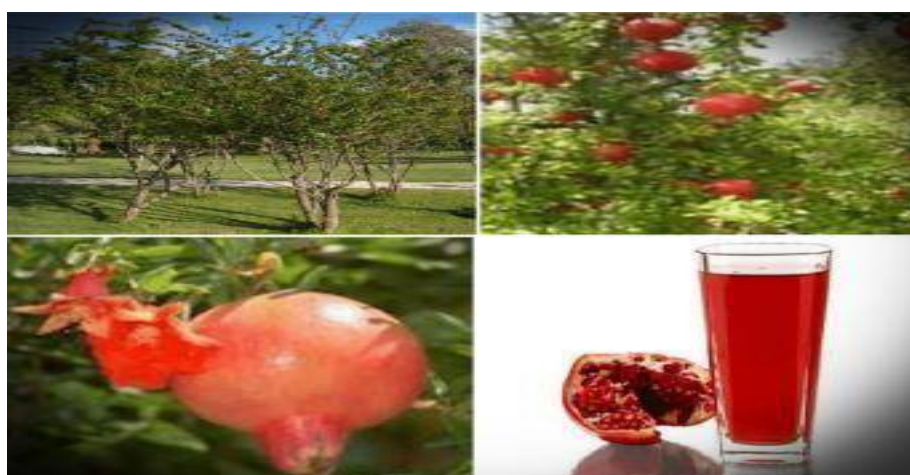
Figure (1): pomegranate tree, fruits, juice.