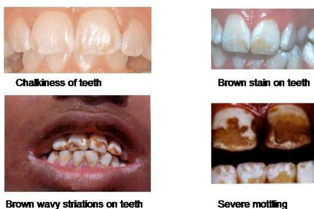
Figure: 4 Types of Mottling