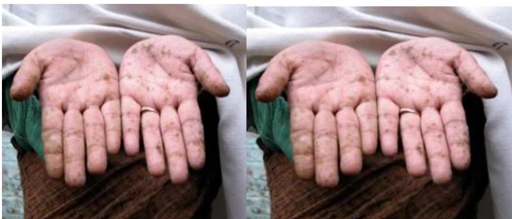
Figure: 1 Signs of Arsenicosis: spots on the hands

Over-exposure to trace elements in geologic materials is responsible for toxicity effects in humans and animals. One of the most studied trace elements in this regard is fluorine. The fluoride ion (F-) stimulates bone formation and also reduces dental caries at doses of at least 0.7 mg/L in drinking water. However, excess fluoride (>1 mg/L) exposure can cause fluorosis of the enamel (mottling of the teeth) and bone (skeletal fluorosis) [15].