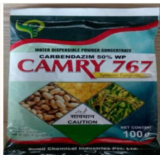
Fig 9: Carbendazim 50% WP.