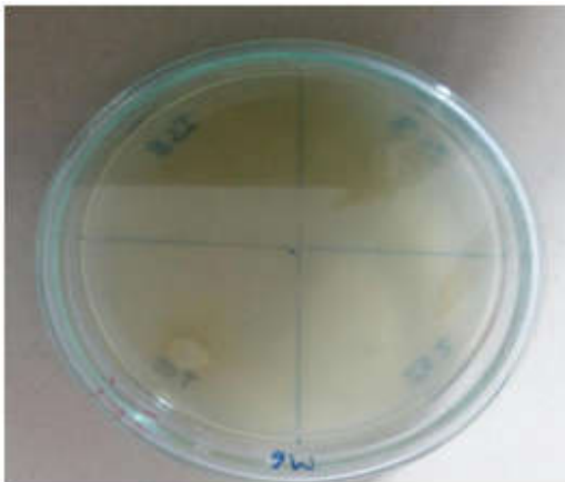
Fig 4: IS1 tolerate 2000 ppm with Mancozeb 75% WP.