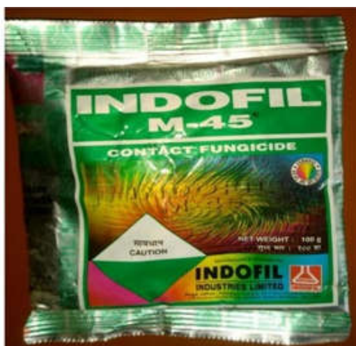
Fig 8: Mancozeb 75% WP