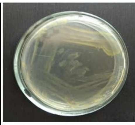
Fig 7: Colonies of Arthrobacter sp. on nutrient agar.