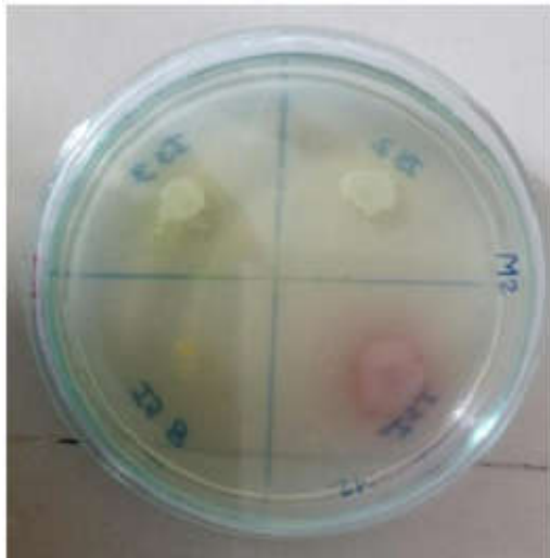
Fig 2: IS1, IS2, IS3 & IS8 tolerate 900 ppm with Mancozeb 75 % WP.