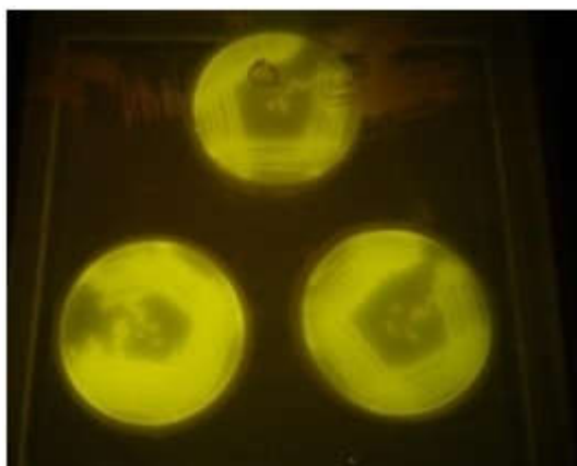
Fig 6: Colonies of Pseudomonas sp. on King's B plates observed under UV.