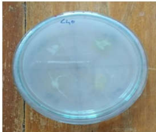
Fig 5: IS1, IS2, IS3 & IS8 tolerate 1800 ppm with Carbendazim 50 %WP.